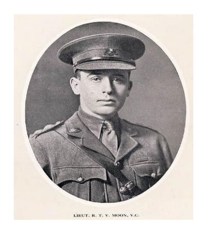
12th May Lt. Rupert Vance Moon VC at Bullecourt

15th May Australians repulse attack Bullecourt