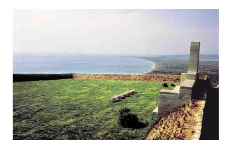
The Nek Cemetery, Gallipoli, looking north to Suvla Bay.

On Chunuk Bair today is the New Zealand National Memorial. Part of the memorial inscription remembers those who came from so far away to participate in the Gallipoli campaign but the words seem appropriate for all who fought at Anzac between April and December 1915: