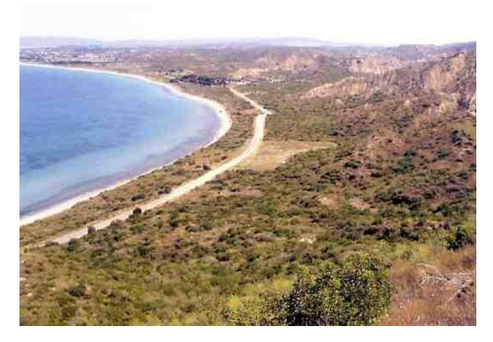
North Beach looking towards Suvla Bay, November 1998.

Today, near the spot where Clarke and men of the 12th Battalion came ashore, is the Anzac Commemorative Site designed for ceremonial events at Gallipoli.