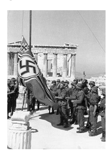
22^{nd} April Evacuation of Greece Began